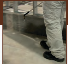
Treat abutting slabs and expansion joints.