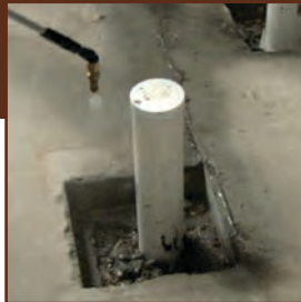
Treat the concrete and plumbing penetrations on slab structures.