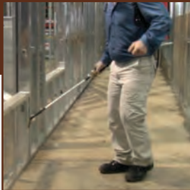
Treat the interior stud walls.